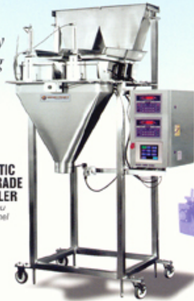
PMB-2 SEMI-AUTOMATIC WDA CHEESE GRADE NET WEIGH FILLER Shown with menu driven control panel