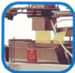
PMB-2FL Shown with optional gravity feed system

Adding this system can increase production by as much as 50%, dispensing the bulk of your free flowing product directly into the weigh bucket. When the target weight is close, the FL gate closes and the vibratory feed accurately completes the fill.