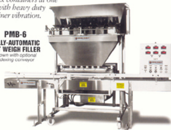
PMB-6 FULLY-AUTOMATIC NET WEIGH FILLER Shown with optional indexing conveyor

Fills six containers at one time with heavy duty container vibration.