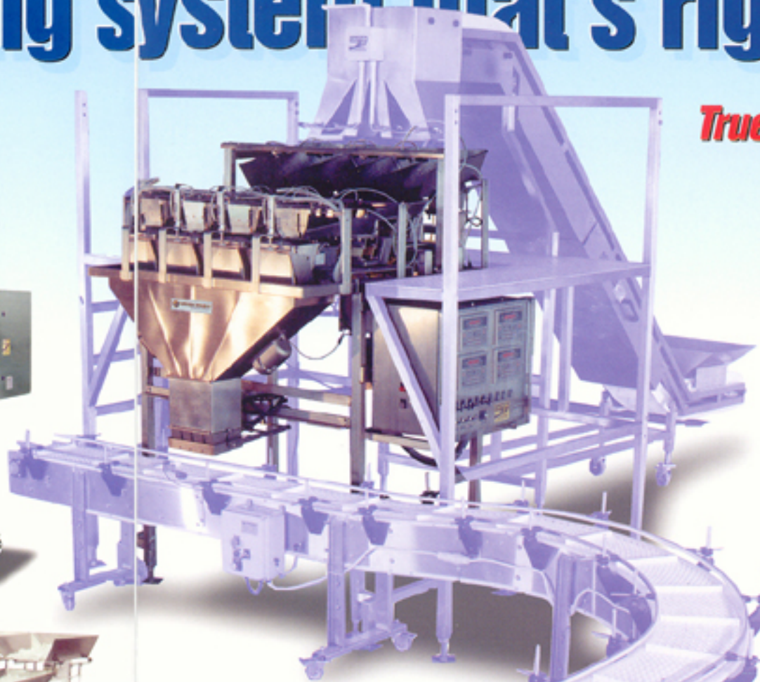
PMB-4 FULLY-AUTOMATIC NET WEIGH FILLER With optional mezzanine, infeed conveyor and container indexing conveyor shown in blue