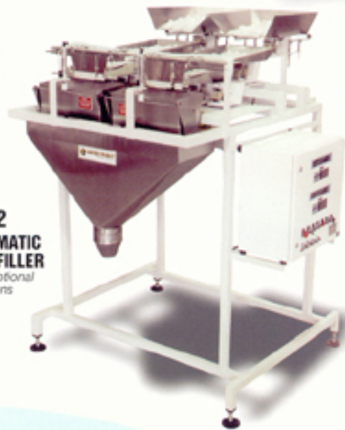
PMB-2 SEMI-AUTOMATIC NET WEIGH FILLER Shown with optional transfer pans