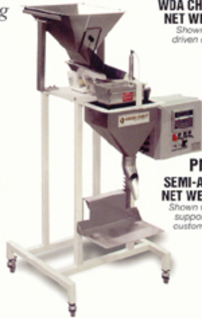
PMB-1 SEMI-AUTOMATIC NET WEIGH FILLER Shown with optional support shelf and custom bag spout

Choose Weigh Right and weigh your options right!